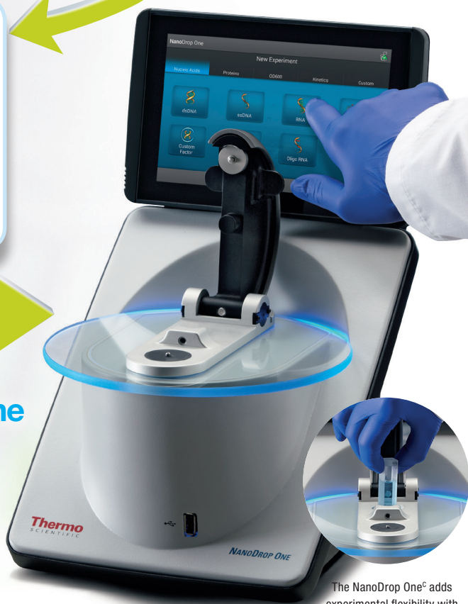
The NanoDrop One c adds experimental flexibility with an additional cuvette position.

For customer service, call 1-800-234-7437 To fax an order, use 1-800-463-2996 To order online: www.fishersci.com